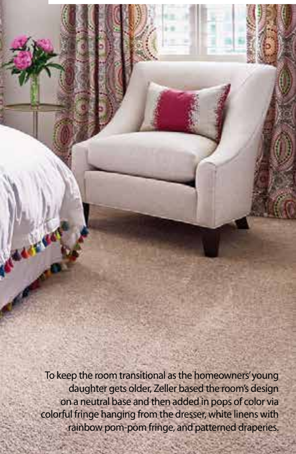
To keep the room transitional as the homeowners' young daughter gets older, Zeller based the room's design on a neutral base and then added in pops of color via colorful fringe hanging from the dresser, white linens with rainbow pom-pom fringe, and patterned draperies.

Zeller's nudge to a bit of a transitional design is truly on display upstairs in one of the Harris' daughters' bedrooms. "Reagan loves color," says Zeller. But in order to appease her mom, who isn't a fan of bold pops of pink and green, Zeller installed a design based on neutrals. White linens with rainbow pom-pom fringe and patterned draperies boasting subtle color and bold design are inventive ways to combine neutral with color. Colorful fringe hang from the dresser hardware, which instantly creates a fresh, young look appropriate for the then eight year old.