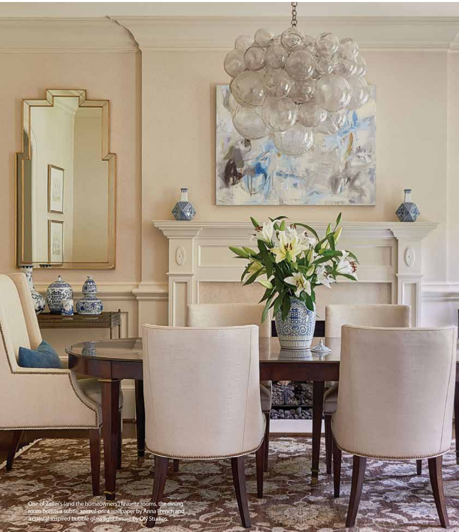
One of Zeller's (and the homeowners') favorite rooms, the dining room boasts a subtle animal-print wallpaper by Anna French and a coastal-inspired bubble glass light fixture by Oly Studios.